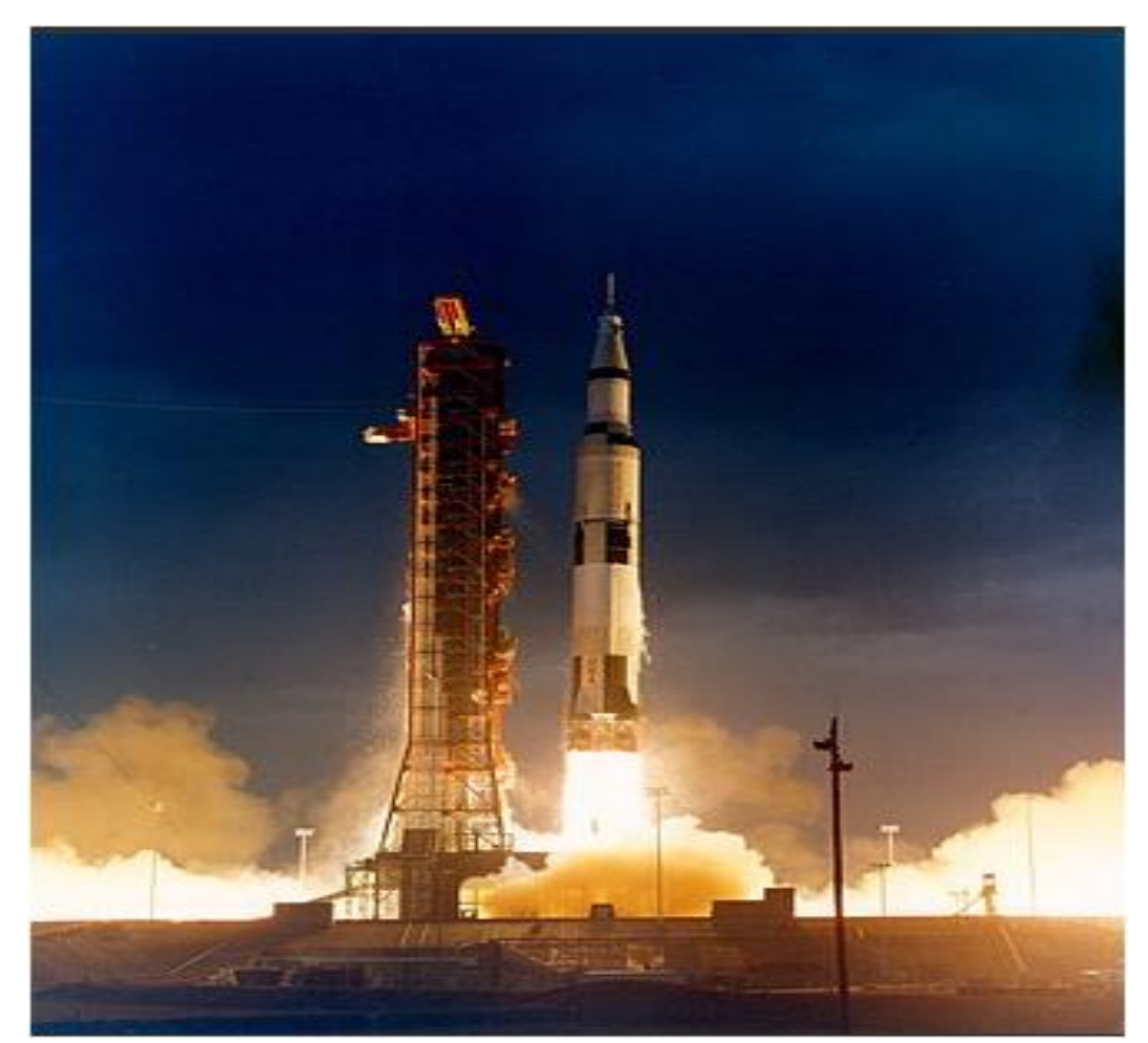
Apollo 14 lifted off from Kennedy Space Center's Launch Pad 39A January 31, 1971.

Some newspaper delivery routes are longer than others. And U.S. Navy Captain Alan Shepard gave this time-honored job new meaning when he carried a daily paper a quarter-of-a-million miles from the earth to the lunar surface. That was during the Apollo 14 mission that began on January 31, 1971. This launch date also was significant because it was the 13<sup>th</sup> anniversary of our nation's orbiting its first unmanned earth satellite, Explorer I.