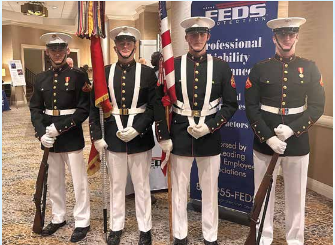
Proud to have Color Guard present the colors to commence FMA's National Convention.