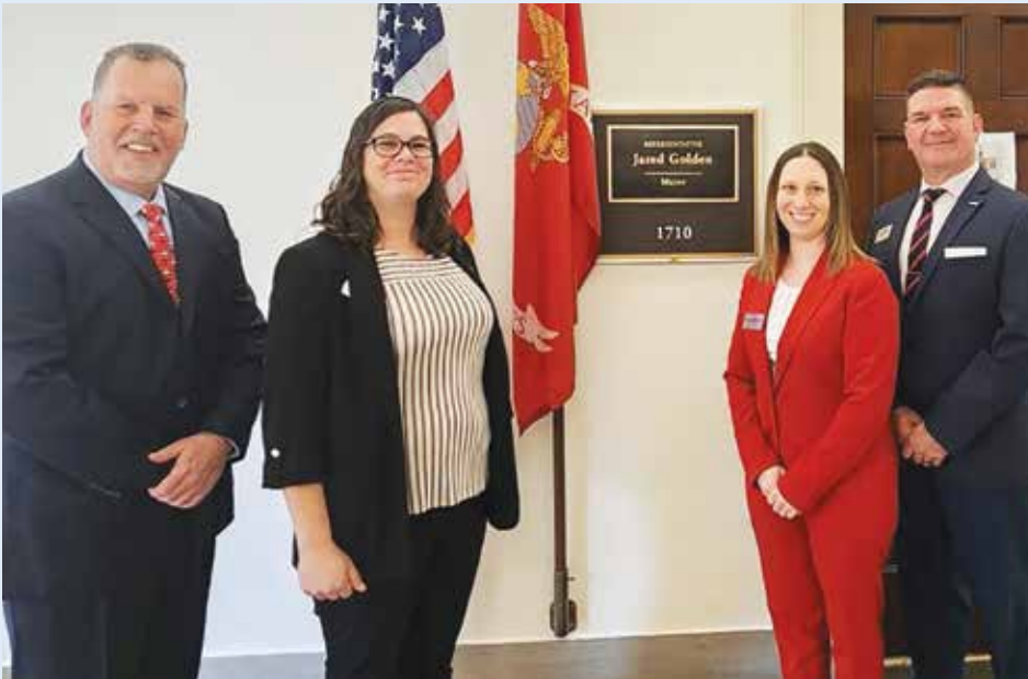
Chapter 6 members pose outside of Rep. Golden's office after meeting with staffers.

recruiters! We cannot thank you enough for introducing new members into the FMA family.