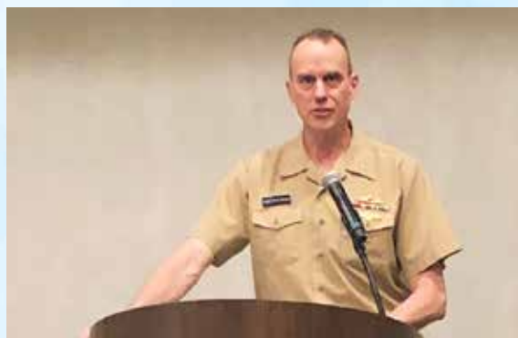
Rear Admiral Brown makes an address during the Shipyard Conference Luncheon.