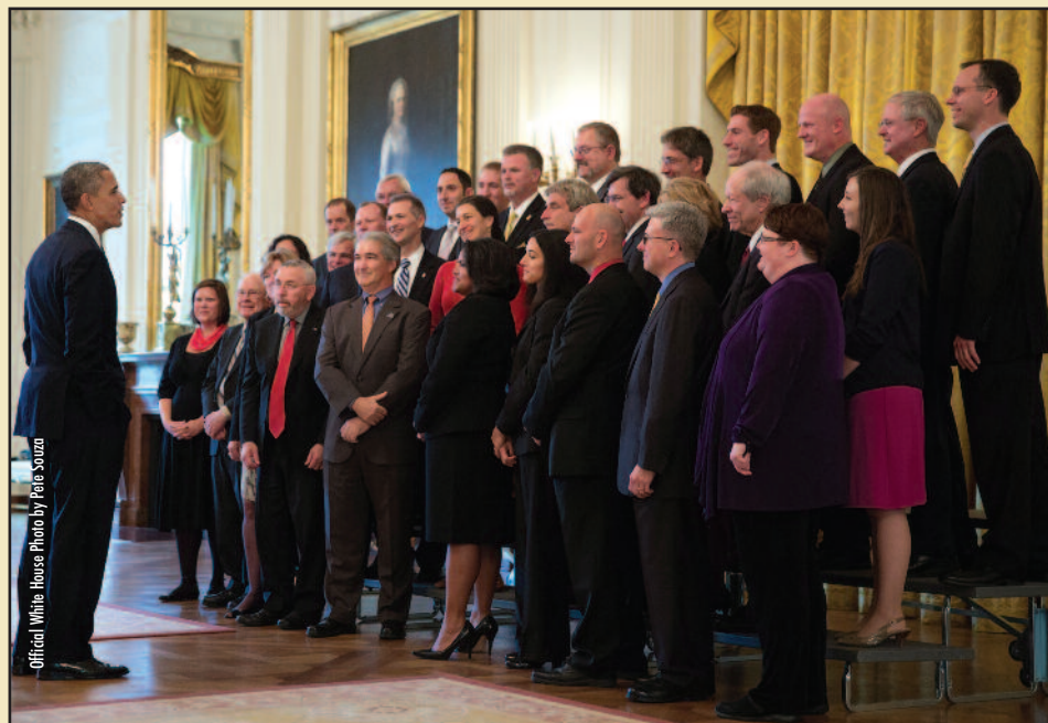
President Barack Obama meets with Samuel J. Heyman Service to America Medals finalists and winners in the East Room of the White House, Oct. 23, 2013.

If you would like to nominate a colleague for this prestigious honor, please visit servicetoamericamedals.org . ■