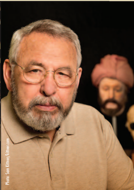
Antonio J. Mendez, Honorary Samuel J. Heyman Service to America Medal

Service to America Medals continued from page 7